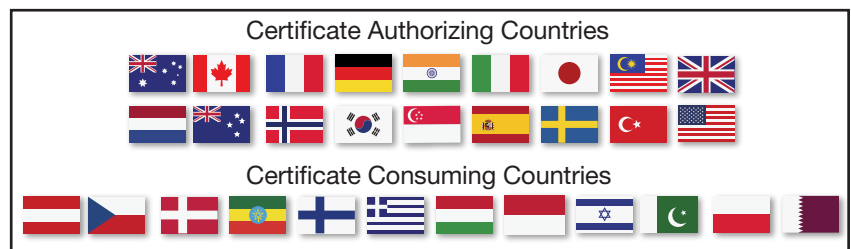
Figure 1: Common Criteria Recognition Arrangement (CCRA) member countries