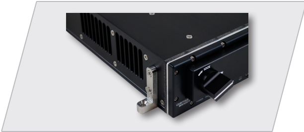
Figure 3: DTS1 with L-bracket mounting