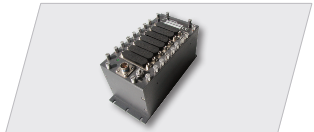
Figure 5: Acra KAM-500

In addition to standard NAS, iSCSI, and PCAP operation, the DTS1 has a special mode that allows the capture of Ethernet packets. This is essentially a sniffer mode where every character is captured and stored into a *.PCAP file. Packet capture is a handy feature for flight test instrumentation (FTI) systems like Curtiss-Wright's Acra KAM-500 to support trouble shooting of Ethernet problems.