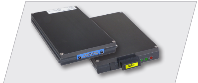
Figure 4: RMC rear and front views