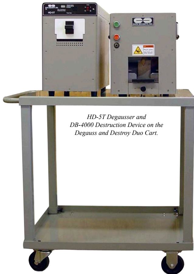
HD-5T Degausser and DB-4000 Destruction Device on the Degauss and Destroy Duo Cart.

For complete compliance with NSA specifications, combine any Data Security, Inc. degausser with any Data Security, Inc. destruction device.